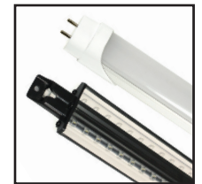
T-8 LED & Thermoseal Lighting